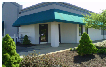
SOCOG's new office location in downtown Chillicothe.

agreed on the final choice. So preparation began for the move. Historical records were returned to county boards, furniture was evaluated for its continued need.